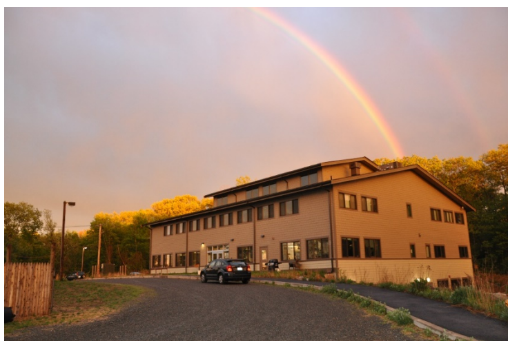
Thomas E. Curtis Wildlife Hospital in Weymouth, MA