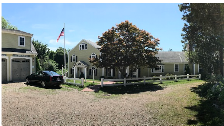
Birdsey Cape Wildlife Hospital in Barnstable, MA

New England Wildlife Centers 500 Columbian Street, South Weymouth, MA 02190 newwildlife.org